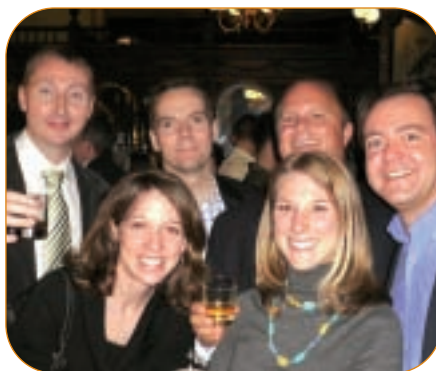
The Go Ahead Tours staff!

This spring, look for changes to the Go Ahead Groups Coordinator website that will make it easier to track your group online, add optional excursions and insurance, and contact potential travelers about your tour. You'll notice new 2008 itineraries and exciting new options for 2008 and beyond! As always, we want and value- your feedback!