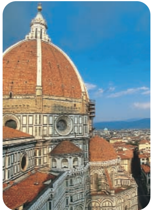
The Magic of Italy is a 15-day favorite covering of Italy's highlights.

FLEXIBILITY This is your group's getaway. Choose from a variety of itineraries geared to keep your group busy seeing as many of the local sights as possible or those that leave ample free time to explore on your own schedule. On one of our signature city stays, you can see the world's famous cities at your own pace. Take a nine-day city stay in London where you can see the historic capital at your leisure. See London Bridge and London Tower, visit Picadilly Circus or observe the famous changing of the Queen's guard. Optional excursions are also available, including a ride on the London Eye followed by dinner. Each of our tours come with a variety of optional excursions and events to enhance your experience!