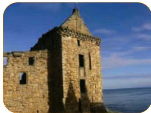
St. Andrews, Scotland