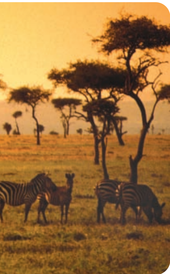
Kenya Wildlife Safari is a 13-day tour through exotic lands.